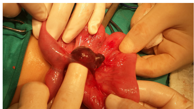
Figure 4. After untwisted Meckel's diverticulum (MD), there were two peritoneal bands which arise from its tip were attached to the mesentery of non adjacent small bowel.